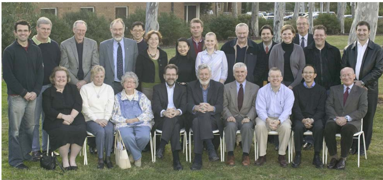
The SDSC team, May 2006